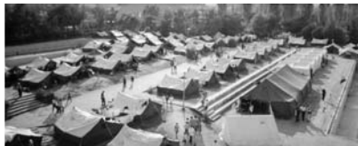
May, 1999 A small WMF team visits Kosovo refugee camps in the Balkans.